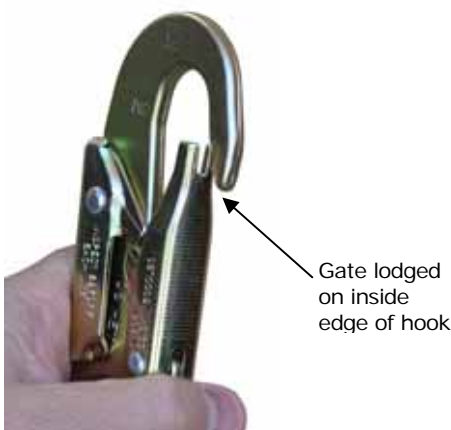
H205 Side View

If during an inspection, any equipment with model H205 hooks, within the batches above have gates that can be manipulated as stated, the product can be returned to Capital Safety Australia for replacement at no cost. Contact Capital Safety on 1800 245 002 to arrange an inspection and replacement accordingly.