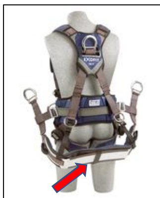
Representative Seat Sling Indicated by Red Arrow

3M Fall Protection has received reports that the aluminum reinforcement plate used in the seat sling on certain DBI-SALA ExoFit™, ExoFit XP™ (inc. Arc Flash), and ExoFit NEX™ (inc. Arc Flash) harnesses can become dislodged from the webbing. In a few instances, the aluminum seat plate has separated from the harness and fallen to the ground, creating a potential dropped object hazard. There have been no reports of injuries or accidents associated with this condition. The performance of the harnesses is unaffected by this issue—they will perform properly in all respects, including as body support for a personal fall arrest system in the event of a fall, even without the added comfort offered by the seat sling.